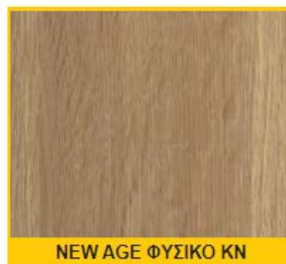
NEW AGE ΦΥΣΙΚΟ ΚΝ