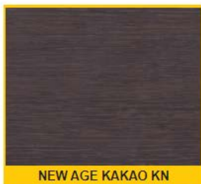
NEW AGE ΚΑΚΑΟ ΚΝ