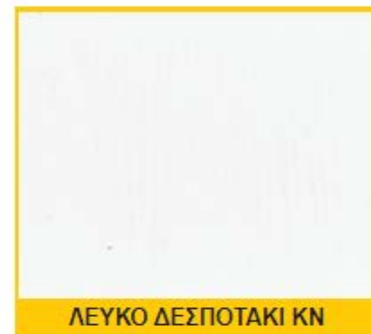
ΛΕΥΚΟ ΔΕΣΠΟΤΑΚΙ ΚΝ